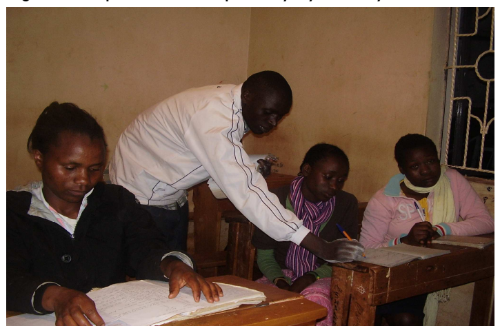
Form (4) Four girls in class revising for the National exams

education. We looking for sponsorship from well-wishers to enable them further their studies in universities and colleges to help then break poverty cycle they were born in.