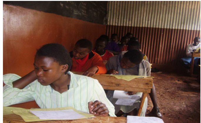
The Class (8)eight preparing for the national exams

Our form four students in children's garden secondary school who are four in number started their national exams in October 26 th due to many challenges, we have high hopes for the girls to do better in their exams and pursue in university and colleges. We also have our class eight candidates who are preparing for their national exams, they will be sitting for them on 24 th Nov 2012. This is he 5 th class sitting for the national exams in children's garden.